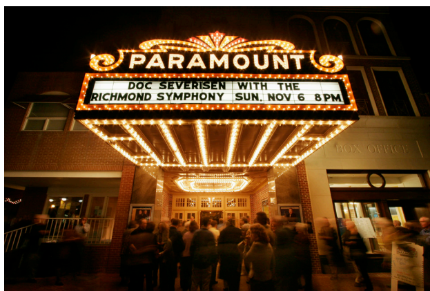
Paramount Theater, located on the historic downtown mall.