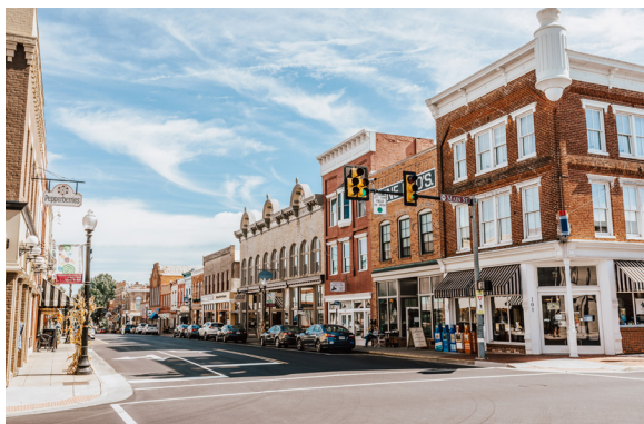
East Davis Street