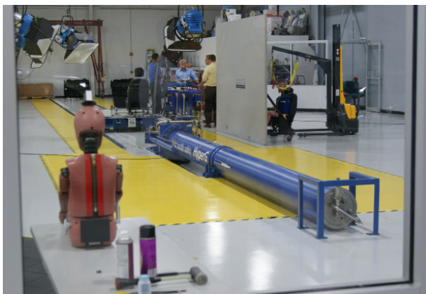
Insurance Institute for Highway Safety