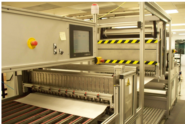
Tri-Dim Filter is a leading manufacturer of commercial/industrial grade air filters