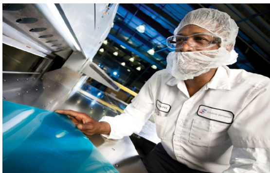
Klöckner-Pentaplast is a leading producer of plastic films for packaging, printing, and specialty applications.