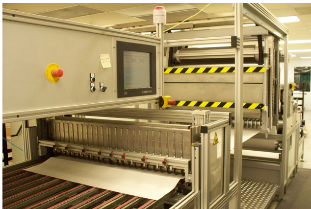
Mann Hummell is a leading manufacturer of commercial/industrial grade air filters