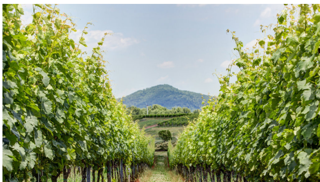
Early Mountain Vineyard, one of Virginia's premier wineries has been named the #1 Place for Weddings by The Knot magazine; and America's #1 Tasting Room by USA Today.