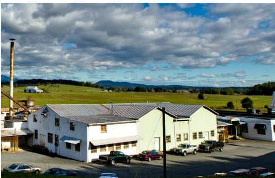
Founded in 1830, Clore Furniture is a manufacturer of solid hardwood, early American furniture.