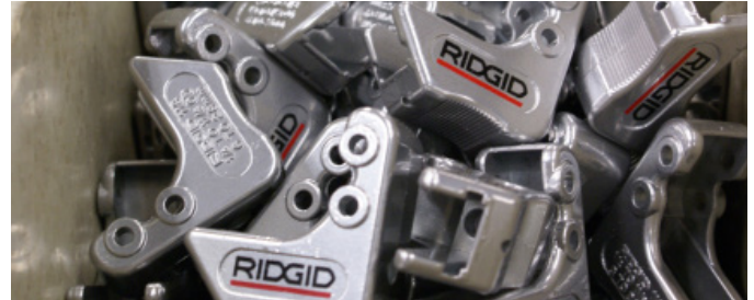
RIDGID, manufacturer of professional quality tools for plumbing, mechanical pipe fitting, construction, HVAC, and facility maintenance.