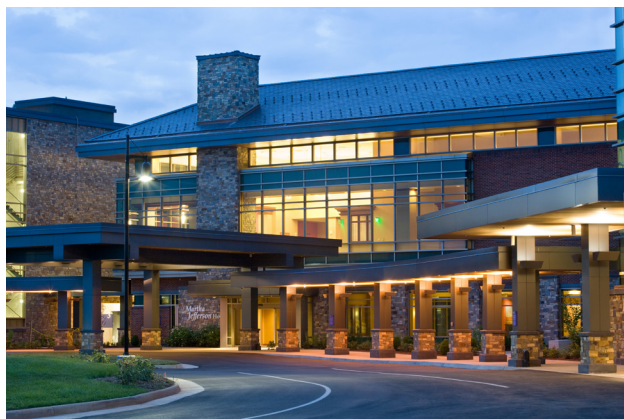
Martha Jefferson Hospital